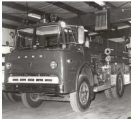
ENG-5 1972 Ward LaFrance First Pumper

Ponderosa VFD has come a long way in 30 years. We are extremely proud of our extraordinary group of volunteer firefighters and our ability to serve the community in which most of us live and work. We have the highest standard of training and practices, and we are fortunate to have state of the art equipment with which to battle fires and perform rescues.