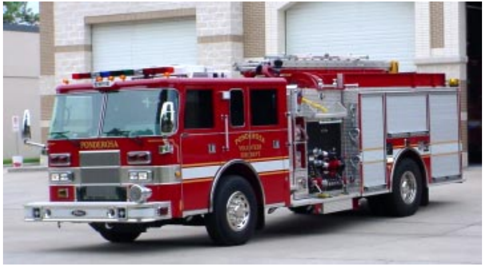
ENG-61 2002 Pierce Saber Pumper

Back then, let me remind you, FM 1960 was only two lanes and there were only about 10,000